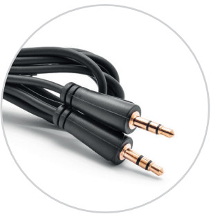
3.5MM TO 3.5MM CORD