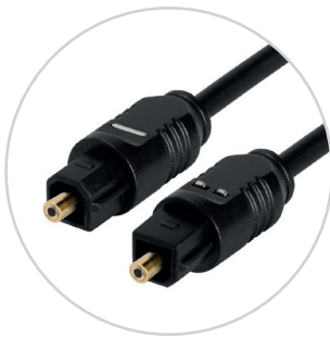
OPTICAL TO OPTICAL CORD

Note: Since the mini TV Transmitter distributes the signal via wireless UHF broadcast, it is best to only use one transmitter per room to avoid interference.