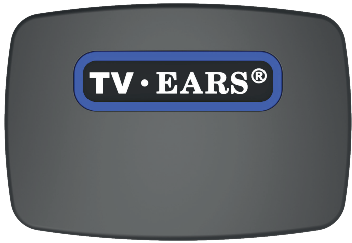
MINI TV TRANSMITTER TOP VIEW