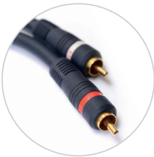
COAXIAL TO COAXIAL