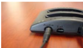
Audio Cord & Transmitter

Plug the Audio cord into the “Audio” jack located on the back of the transmitter. Both of these items came with your TV Ears system.